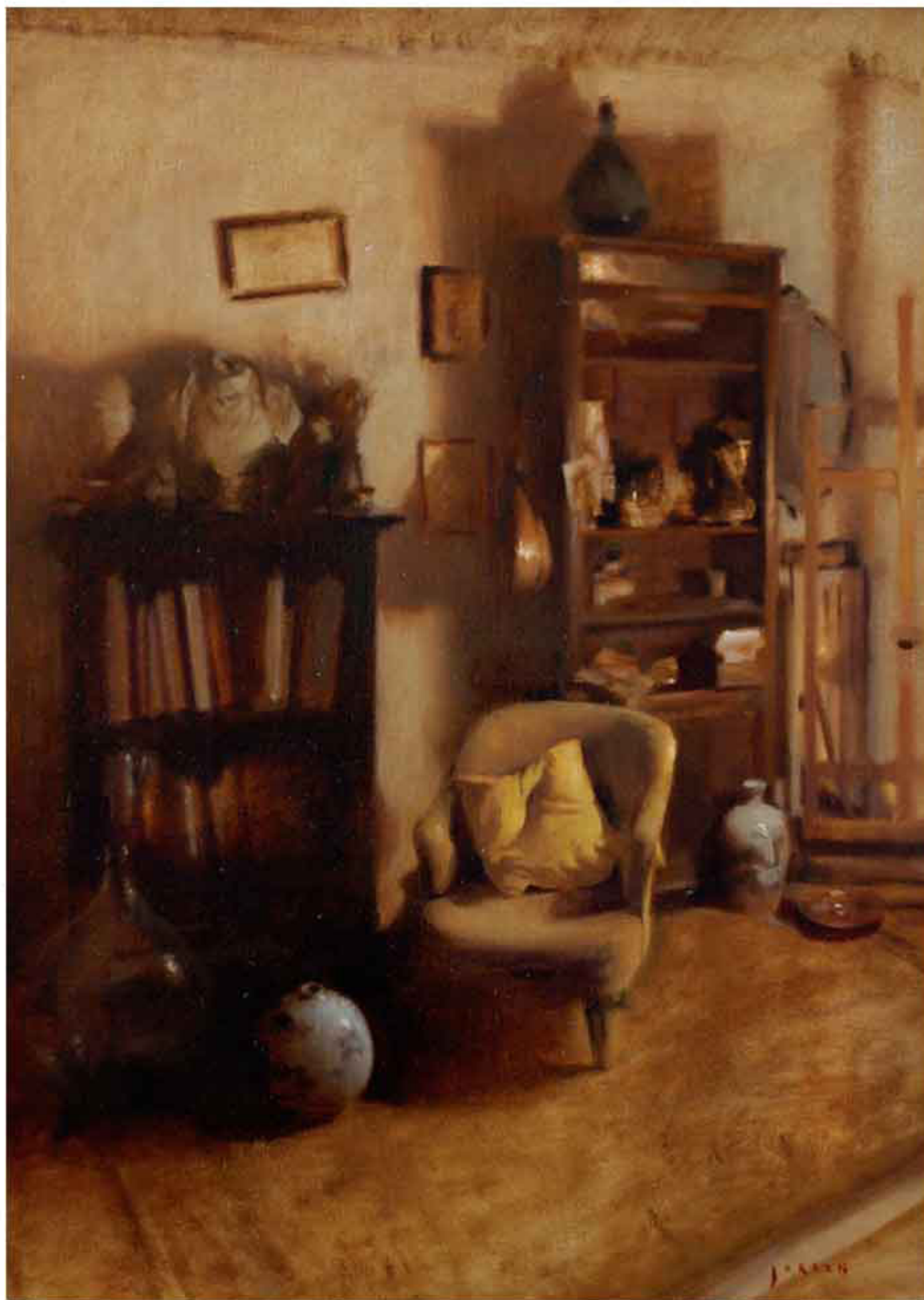
ABOVE Studio Interior 2008, oil on linen, 21 x 16. Private collection.

The artist has found a fruitful subject in painting interior scenes of his home and studio. "The thing that attracts me to interiors is how they represent an intimate space," the